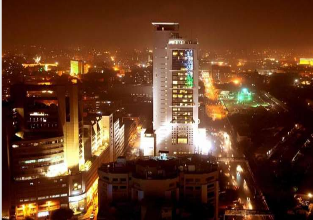
Commercial Capital of Pakistan